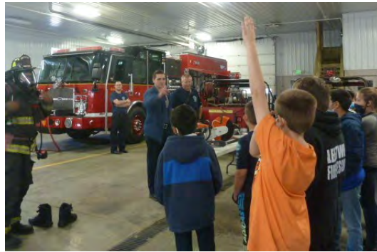
Lee Township Emergency Services provided an interactive fire prevention program at the station for Pullman Elementary students for the annual Fire Prevention Week in October. See page 1 for fire safety tips and remember smoke detectors save lives.