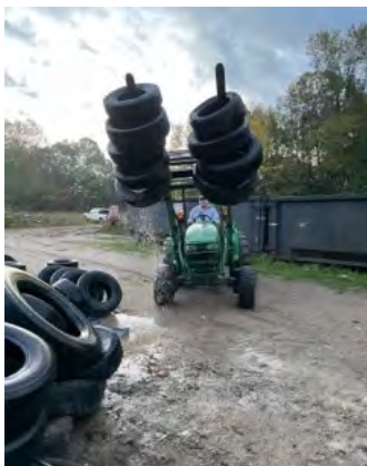
Pictured above: Thanks to a grant from the SW MI Solid Waste Consortium and a handful of volunteers, 886 tires from were removed from Lee Township.

Pictured right: 2021 celebrated the 20th year for Pullman Pride Day and $1500 was raised for college scholarships for area youth. The day was full of fun with many activities including a flea market /craft fair, disc golf, community picnic, dunk tank, fishing tournament, soccer, Bingo, wood carver, live music, and drive-in movie.