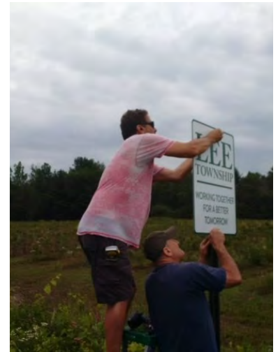
Lee Township has new (donated) signs to greet those who drive through our Township with our mantra "Working Together for a Better Tomorrow."