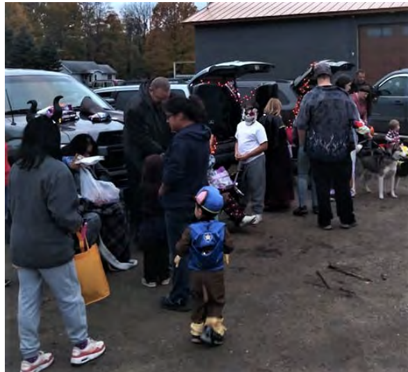
Fall fun this year included an Octoberfest fundraiser sponsored by Beautify Pullman, including kid's crafts, face painting, food, music and raffle; Trunk n' Treat in Diamond Supply parking lot; and the annual Fall Fest at the Linking Center. Thanks to all who helped out.