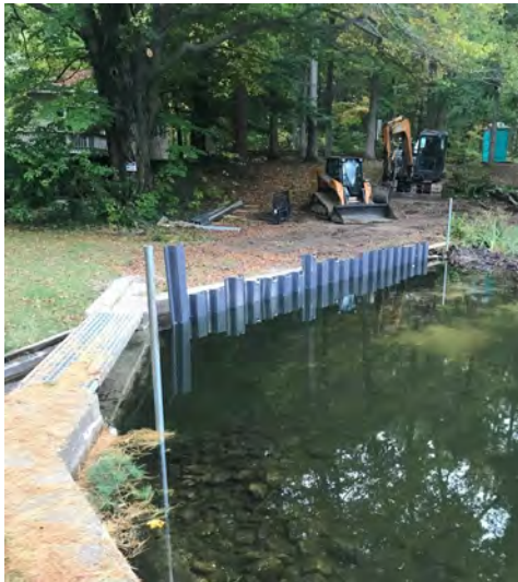
Repair work on the Lower Scott Lake weir finally began late October after years of contractor delays.

It's hard to keep up these days on all the GREAT improvements happening in Lee Township. Business owners, residents, volunteers, and nonprofits all working to make sure the future of Lee Township is brighter than ever.